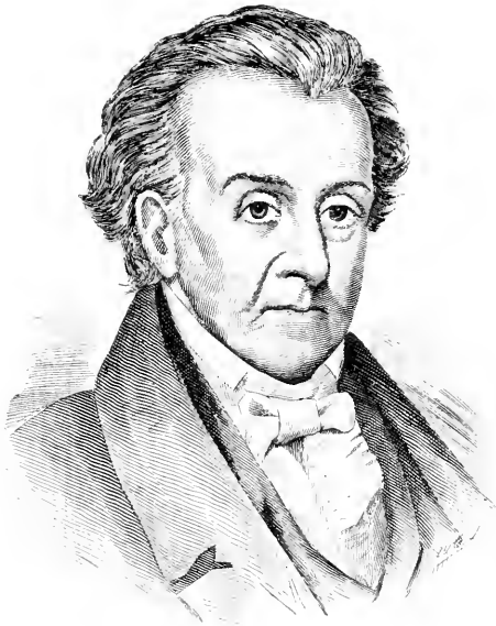
John Cotton Smith